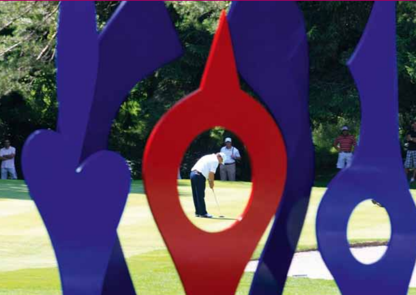
Top European golfers feel at home at the Grand Resort Bad Ragaz. Left to right: Sam Torrance, Costantino Rocca and Carl Mason